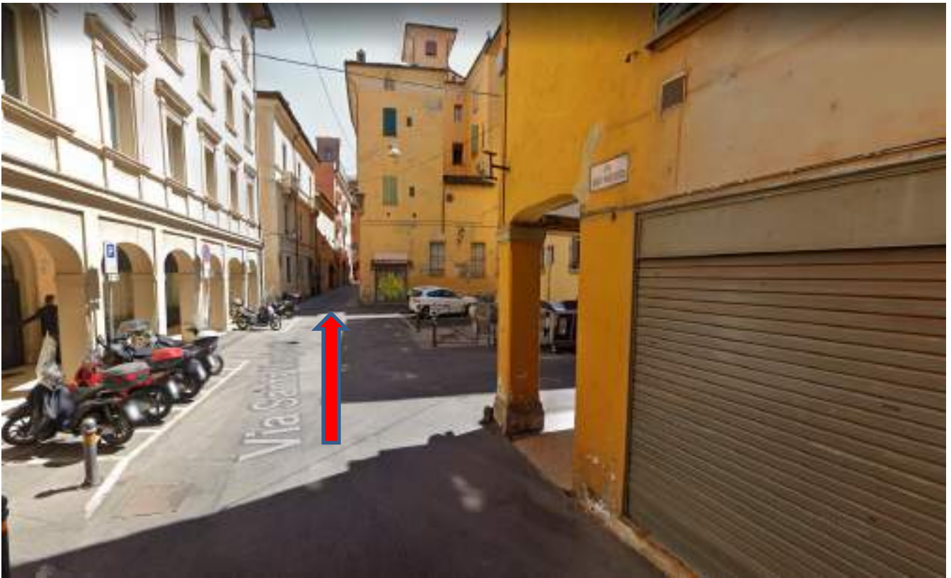
- At the end of Via Santa Margherita you will get to the intersection with VIA DE' FUSARI